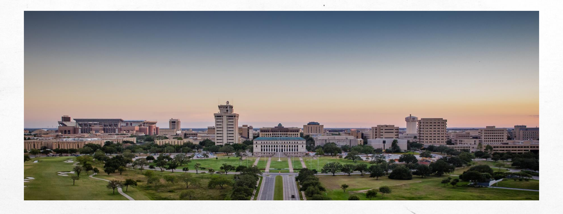
Transportation Services Advisory Committee Dec. 2, 2020